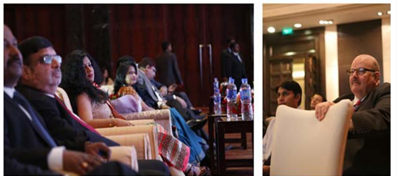
Images from Actual Events Executed by Nimbus Travel