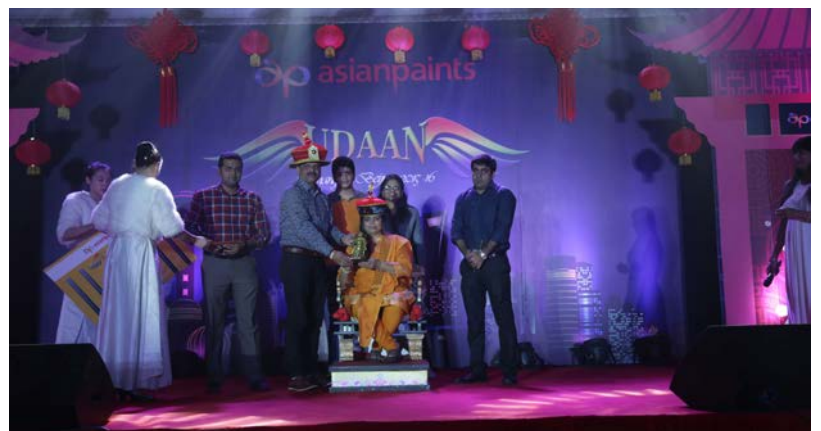
Images from Actual Events Executed by Nimbus Travel