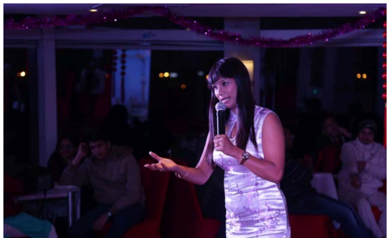
Images from Actual Events Executed by Nimbus Travel