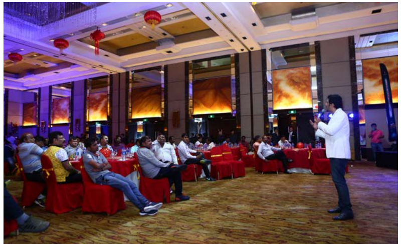
Images from Actual Events Executed by Nimbus Travel